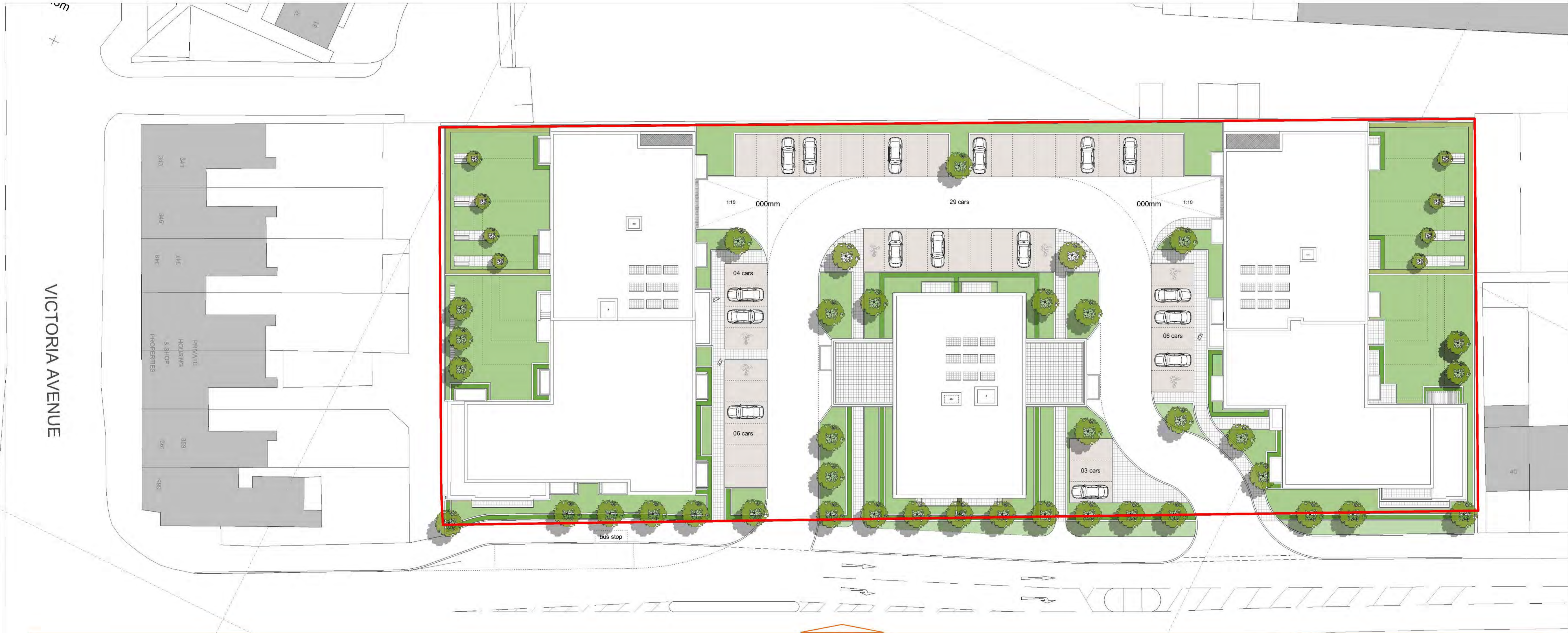
Fairfax Drive - Street Elevation