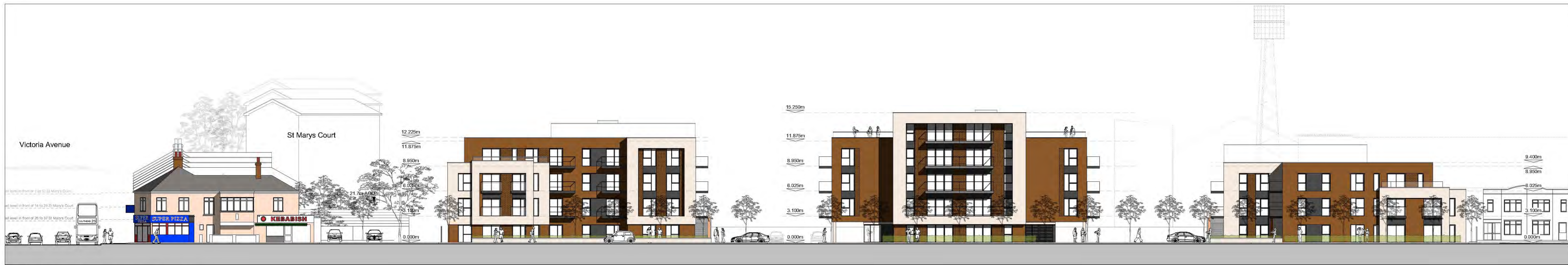
Fairfax Drive - Street Elevation in Context